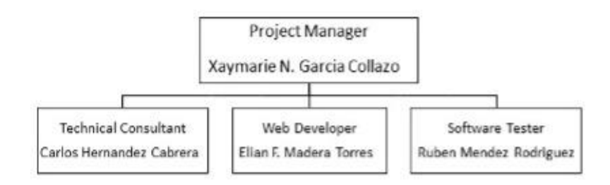
Figure 2 Real Stone Solutions Structure

This Figure is an example of how the structure is going to work, we are going to be rotating as required. The explanation for the roles is in table 2 called responsibility.